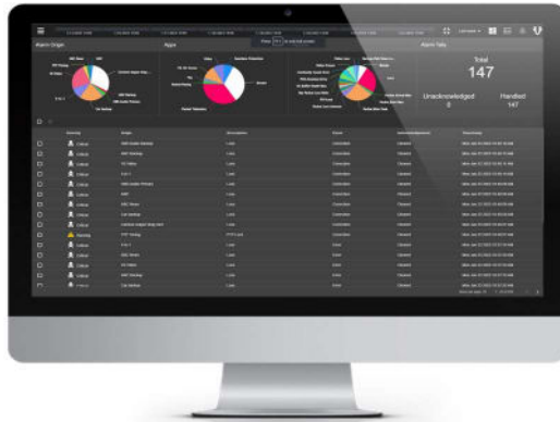
BMG Event Management Dashboard