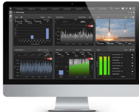
BMG Stream Analysis Dashboard