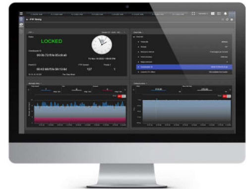
BMG PTP Analyzer Dashboard